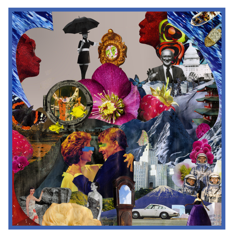
The most simple things are simple for a reason. A distraction from the craziness we as humans have created.